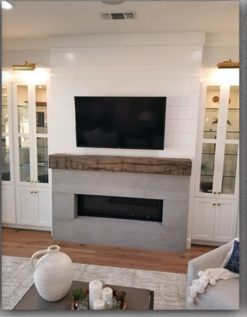
LARGE BARN BEAM - SILVER