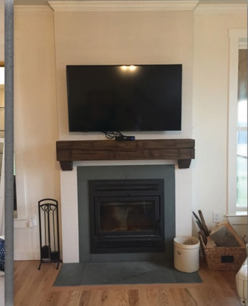
SMALL PLAIN POST - BROWN WITH RUSTIC CORBELS