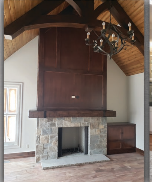
LARGE BARN BEAM - BROWN WITH DECORATIVE STRAPS