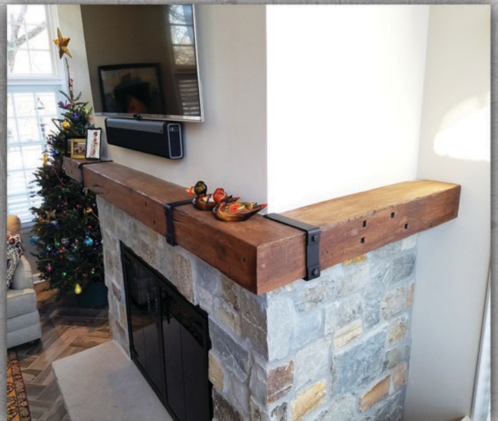
RUSTIC BARN WOOD - BROWN WITH DECORATIVE STRAPS

*ASTM E136-12 "Standard Test Method for Behavior of Materials in a Vertical Tube Furnace of 750°C"