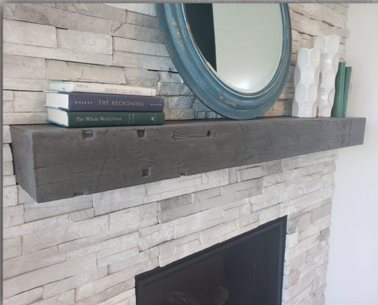
RUSTIC BARN WOOD - GRAPHITE